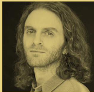
Greg Fox